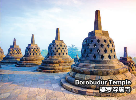
Borobudur Temple 婆罗浮屠寺