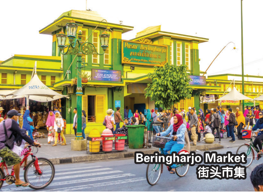
Beringharjo Market 街头市集