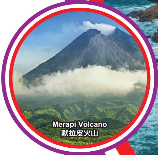
Merapi Volcano 默拉皮火山

行程次序，以当地旅社安排为准。 Sequences of Itinerary are subject to local arrangement.