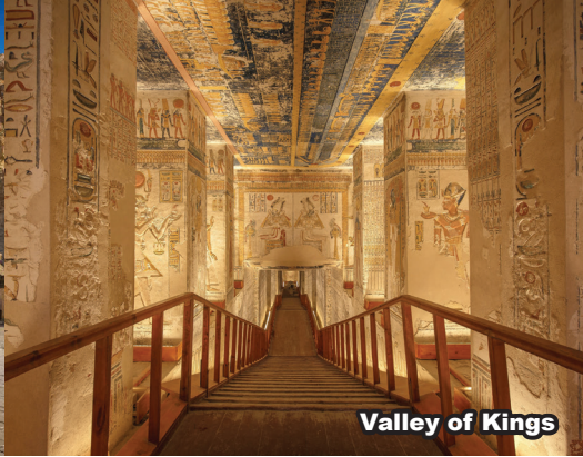
Valley of Kings