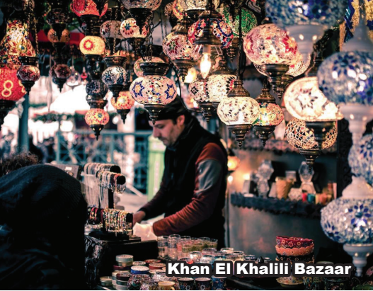
Khan El Khalili Bazaar