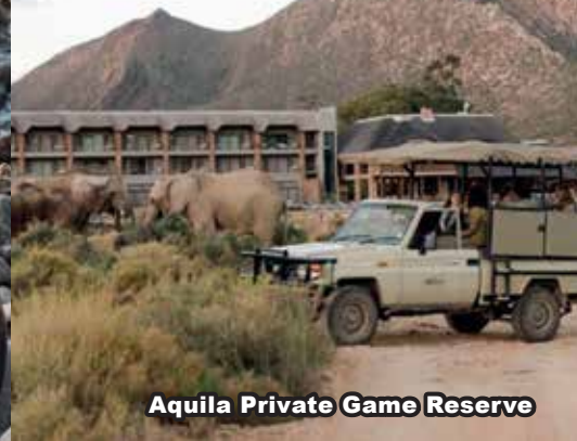
Aquila Private Game Reserve