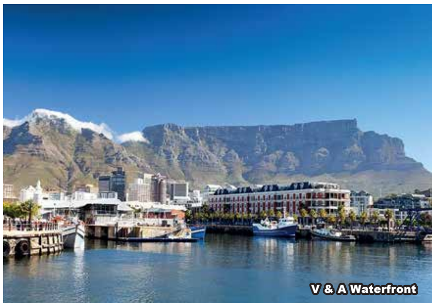
V & A Waterfront

Victoria & Alfred (V&A) Waterfront - South Africa's oldest working harbour, which dates back to 1654, first jetty was built by famous Dutch colonist Jan van Riebeeck. The landmarks that make up the tourist attractions, including the Clock Tower, the Original Port Captain's Office, Aquarium, Big Wheel, etc.