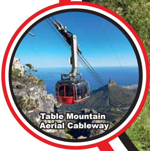
Table Mountain Aerial Cableway