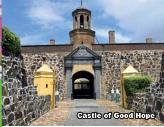
Castle of Good Hope