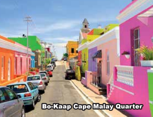
Bo-Kaap Cape Malay Quarter