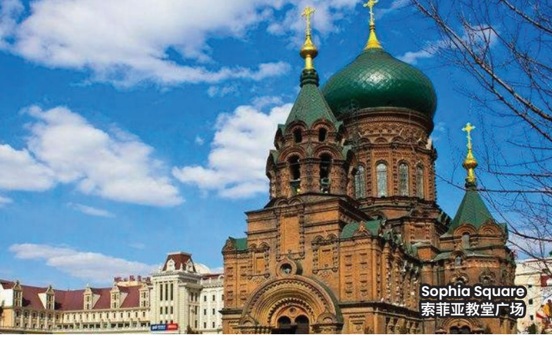
Sophia Square 索菲亚教堂广场