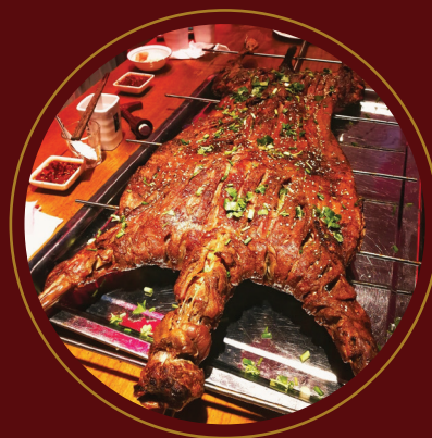
Roasted Lamb 烤全羊