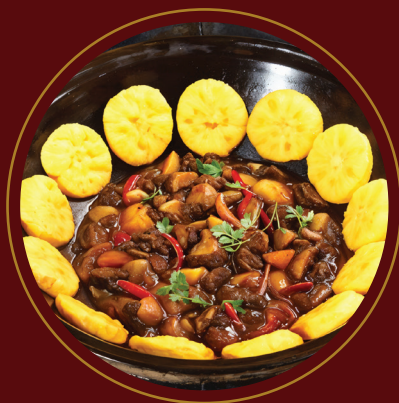
Northeast Iron Pot Stew 东北铁锅炖