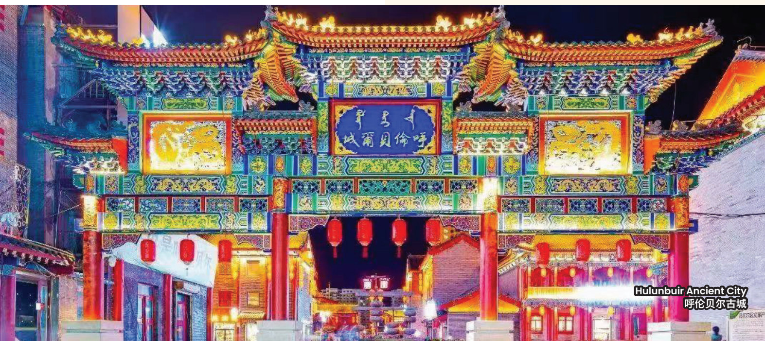
Hulunbuir Ancient City 呼伦贝尔古城

行程次序以当地旅行社安排为准。行程，膳食，住宿，交通等可能会因不可抗拒因素而更动，恕不另行通知。