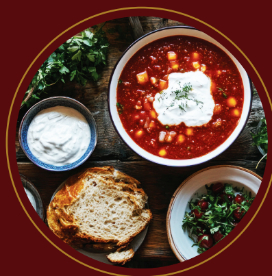
Russian Flavor 俄罗斯风味