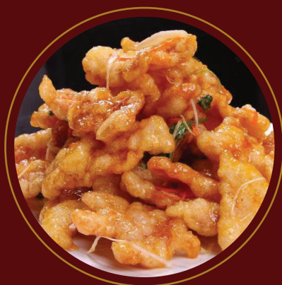
Traditional Northeast Cuisine 老式东北菜