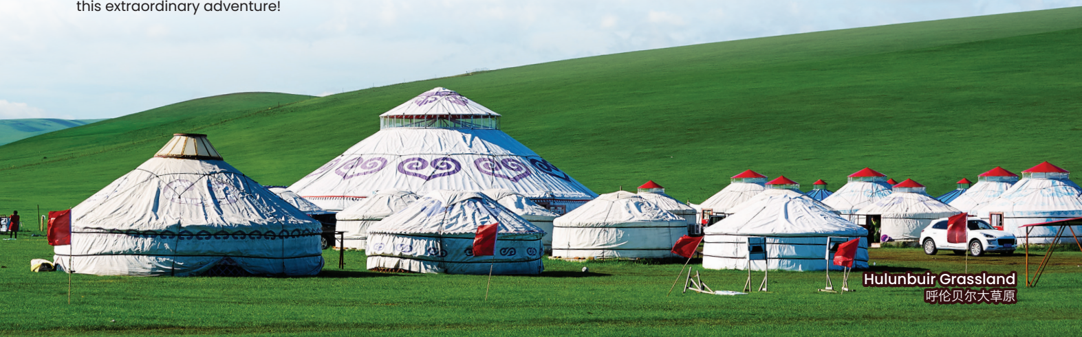
Hulunbuir Grassland 呼伦贝尔大草原