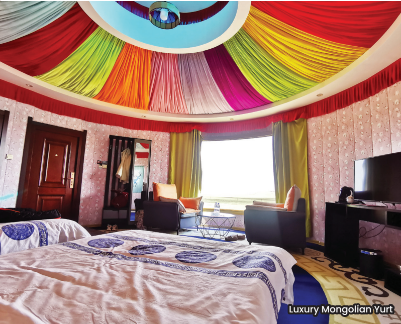
Luxury Mongolian Yurt

Embark on a complete journey at 5-star and handpicked hotel, offering a quality & comfortable stay. 全程安排5星级和精选酒店, 让您在整个旅程中享受到有质量且舒适的住宿环境。