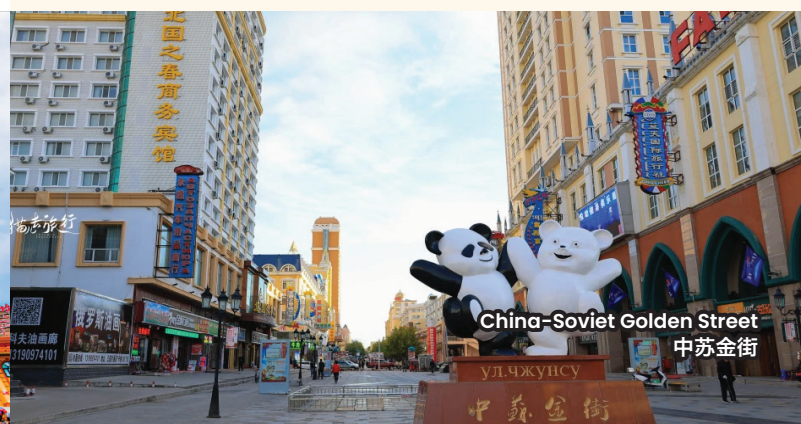
China-Soviet Golden Street 中苏金街