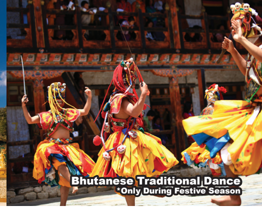
Bhutanese Traditional Dance *Only During Festive Season