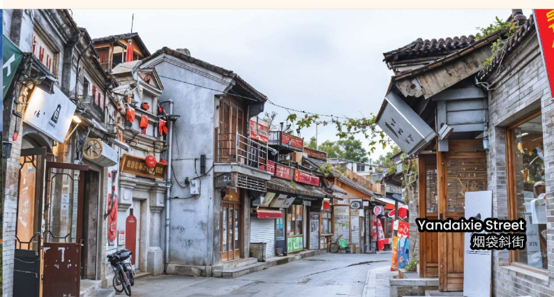
Yandaixie Street 烟袋斜街

Sequences of itinerary are subject to local arrangement. Itineraries, meals, hotels and transportation are subject to change without prior notice.