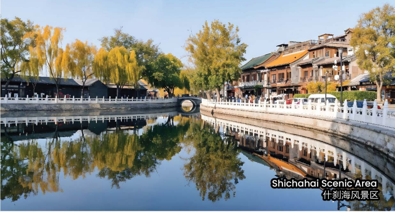
Shichahai Scenic Area 什刹海风景区