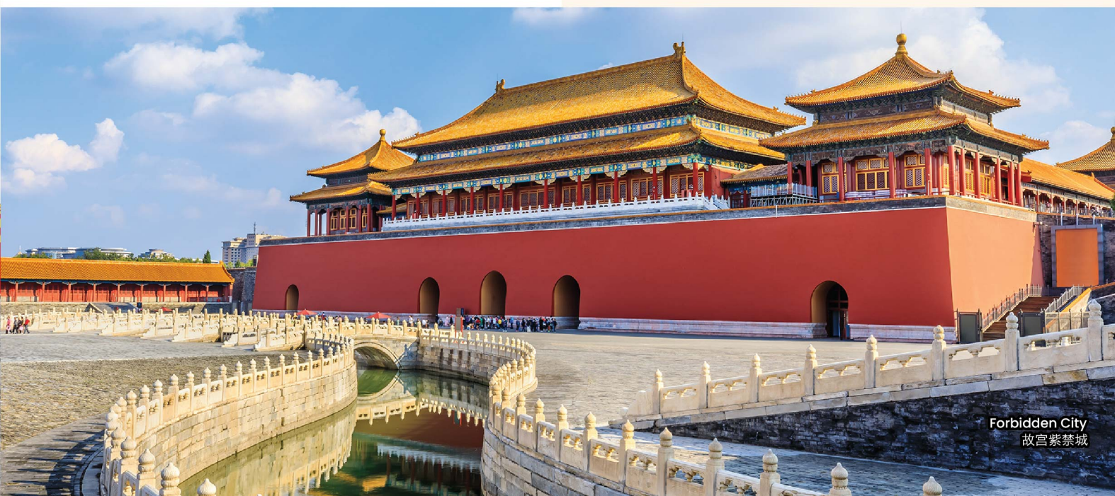
Forbidden City 故宫紫禁城

行程次序以当地旅行社安排为准。行程, 膳食, 住宿, 交通等可能会因不可抗拒因素而更动, 恕不另行通知。