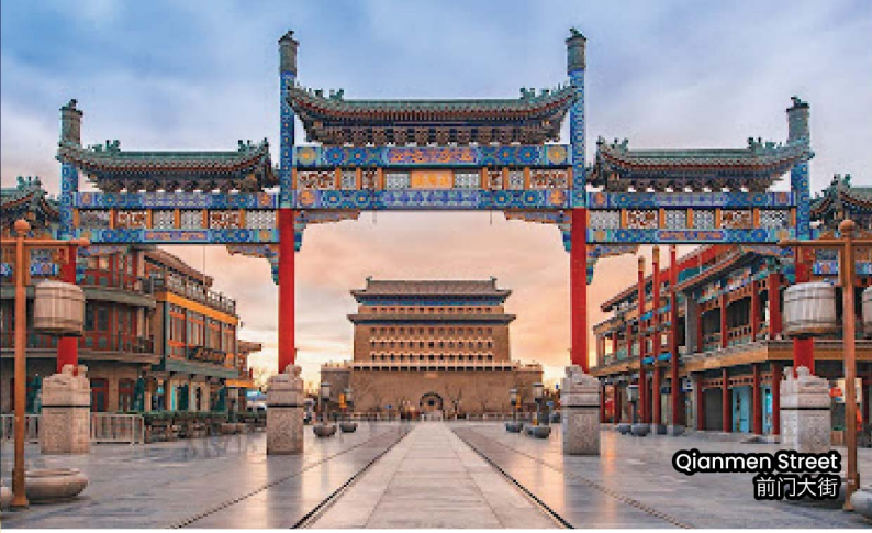
Qianmen Street 前门大街